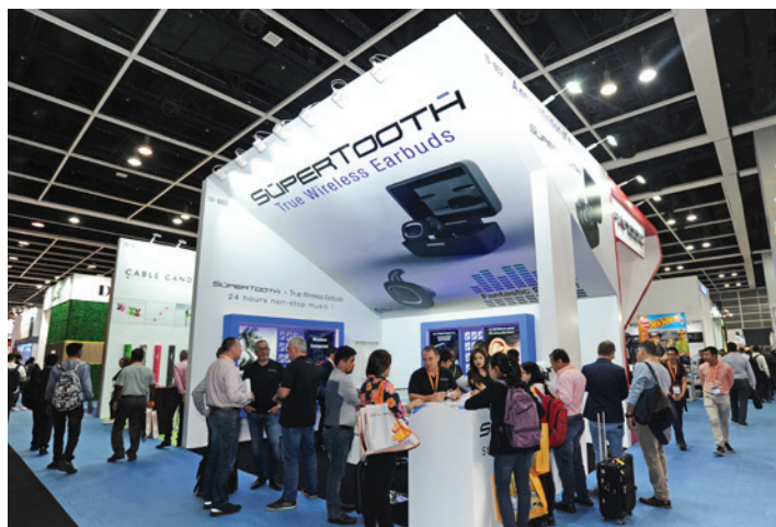
Hall of Fame showcases over 570 top-tier brands 「品牌薈萃廊」展示超過570個頂級品牌